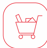
InStore Behavior & Product Zones Performance